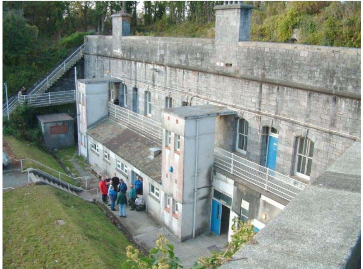
Barrack Block Woodlands Fort